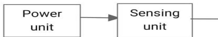
Fig 1.0 Block diagram of automatic hand sanitizer dispenser (Swagatam, 2020)

The components that were used for the construction are 9V battery, Light Emitting diodes (LEDs), Transistors, 555 timer, resistors, solenoid, and passive infrared (PIR) sensor. The above components were bought from 41 Iweaka Road at PATECH electronic store. The components were connected as in the circuits diagram.